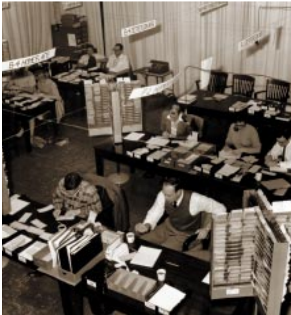
Staff analyze maintenance data in RAND's Logistics System Laboratory in the early 1950s—before the computer era.

In the 1950s, prompted by the growing Soviet atomic capability, RAND studies U.S. Air Force vulnerability in an atomic war and examines alternative approaches to defending Europe. Resulting work on NATO force planning in 1964–1966 leads to a major change in NATO strategy away from automatic, massive nuclear retaliation and toward a more flexible response that relies on strong conventional forces in Central Europe. A 1971 report suggests reallocating NATO's tactical air resources toward nonnuclear attacks of enemy air bases, and a 1973 study of vulnerable U.S. Army equipment in Central Europe prompts the secretary of defense to increase army stocks there. In 1983, RAND refutes the contention that Soviet bal-