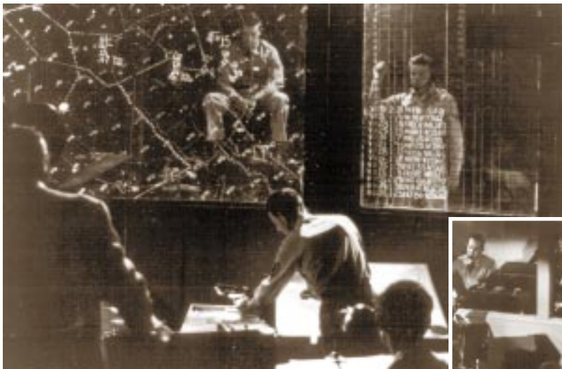
In the early 1950s, RAND sets up a Systems Research Laboratory (left) to train the “systems” of men and machines at Air Defense Centers to prevent enemy aircraft from getting through. Simulated crises, “failures,” and debriefings place more and more stress on the system, which gradually “learns” how to handle situations far more demanding than those that actually could occur. Eventually, the entire Air Defense System implements the RAND training program, and its tremendous growth leads to the creation in 1957 of a separate corporation, the Systems Development Corporation, with its laboratory shown here in the early 1960s (below).