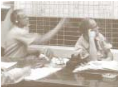
In the early 1960s, RAND helps Air Force officers (above) improve the scheduling of aircraft maintenance. By 1967, RAND statistical models predict the number and types of mechanics needed for unscheduled maintenance.

Building on its JOHNNIAC computer, RAND begins work in 1960 on the JOHNNIAC Open Shop System (JOSS), the first online, interactive computer system,