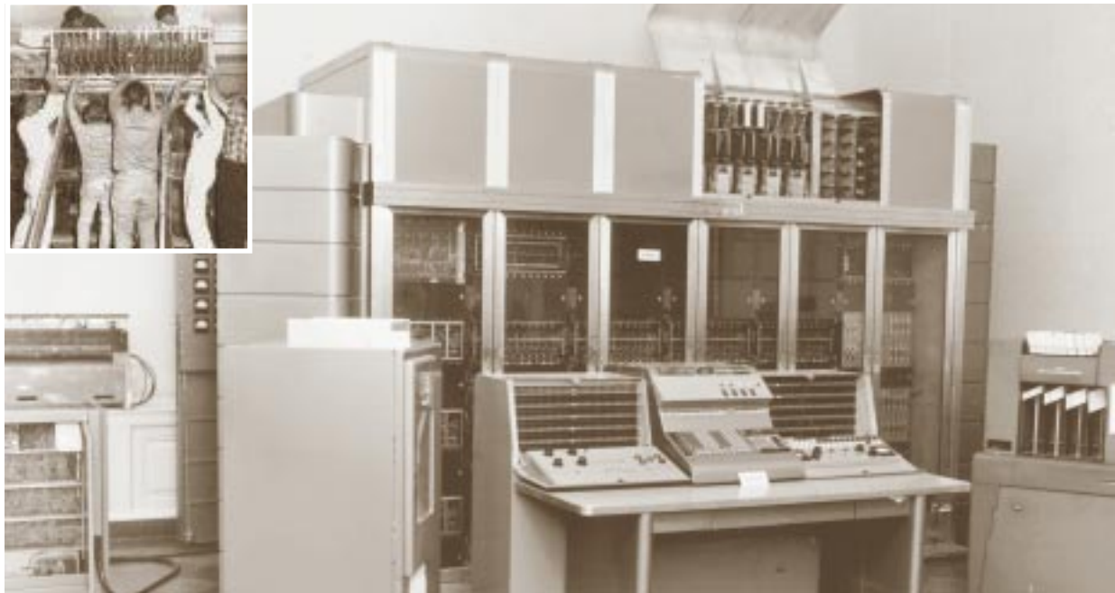
It takes an entire crew of men to disassemble and move the components of the single JOHNNIAC computer (inset). In 1966, after more than a decade of service at RAND, the pioneering JOHNNIAC assumes its place of honor at the Los Angeles County Museum of Science and Technology (left).