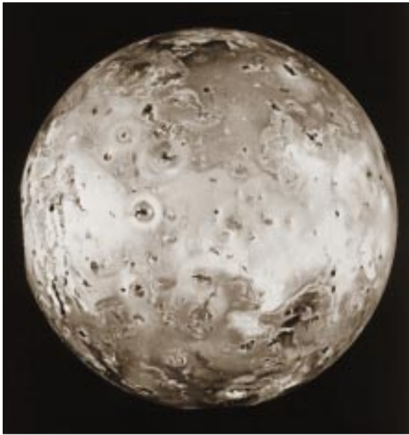
In the late 1990s, RAND plays a pivotal role in mapping the moons of Jupiter. Recent images sent back from the Galileo spacecraft show huge cracks on the frozen, ice-encrusted surface of Europa (right) and plumes of smoke trailing from enormous volcanoes on Io (above), the only body in the solar system other than Earth with active volcanoes.

Whereas the term “revolution in military affairs” commonly refers to changes in warfare brought about by technological breakthroughs of the 1990s, other global and domestic trends of the post-cold war era spawn myriad additional revolutions in U.S. military missions, strategies, and standard operating procedures. RAND advice begins in 1989 with a “strategies-to-task” framework that allows planners to compare which forces link to national objectives. A 1993 report, The New Calculus: Analyzing Airpower’s Changing Role , argues that modern, land-based air forces are uniquely suited to meeting many post-cold war military needs; the report endorses overall U.S. force reductions yet underscores the need for selective modernization. Several studies conducted for the 1997 Quadrennial Defense Review lead to a Pentagon